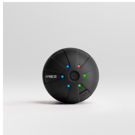
Hypersphere Go (12)