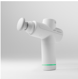
Hypervolt Go 2 (12)